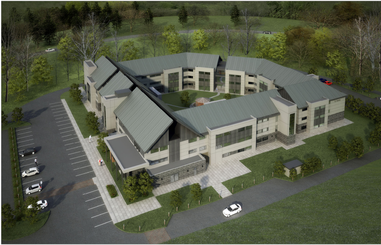
Proposed 3D Sketch Plan