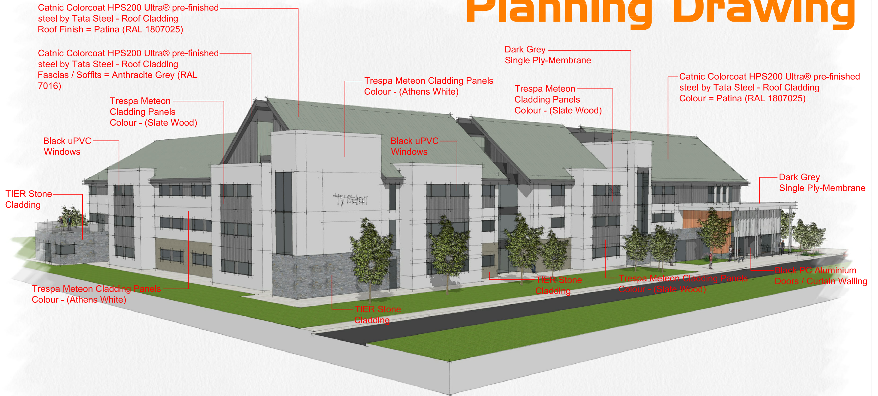
Proposed 3D Sketch / External Finishes